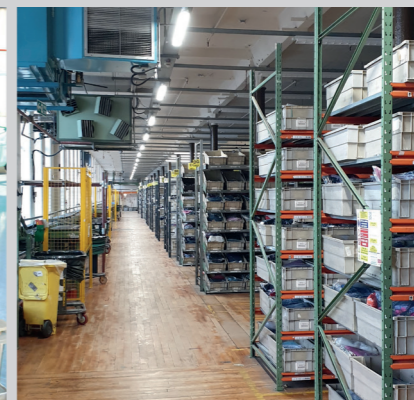
Sustainable and green solutions