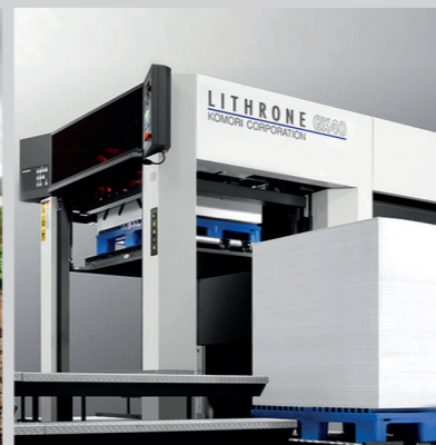
Manufacturing/ industrial equipment