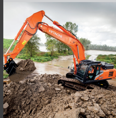
Construction & heavy plant machinery

We have many years of trusted, in-depth product and market knowledge and industry expertise in: