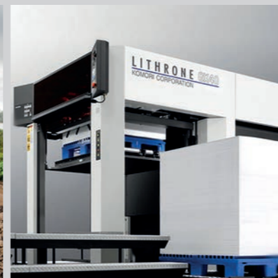
Manufacturing/ industrial equipment